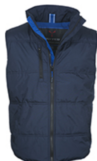
NAVY DRESS BLU/BLU ROYAL