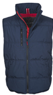
NAVY DRESS BLUE/ROSSO