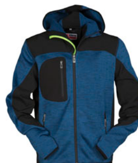
BLU MELANGE/NERO-GIALLO FLUO