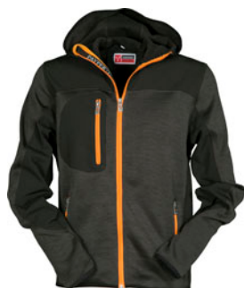
STEEL GREY MELANGE/NERO-ARANCIO NEON